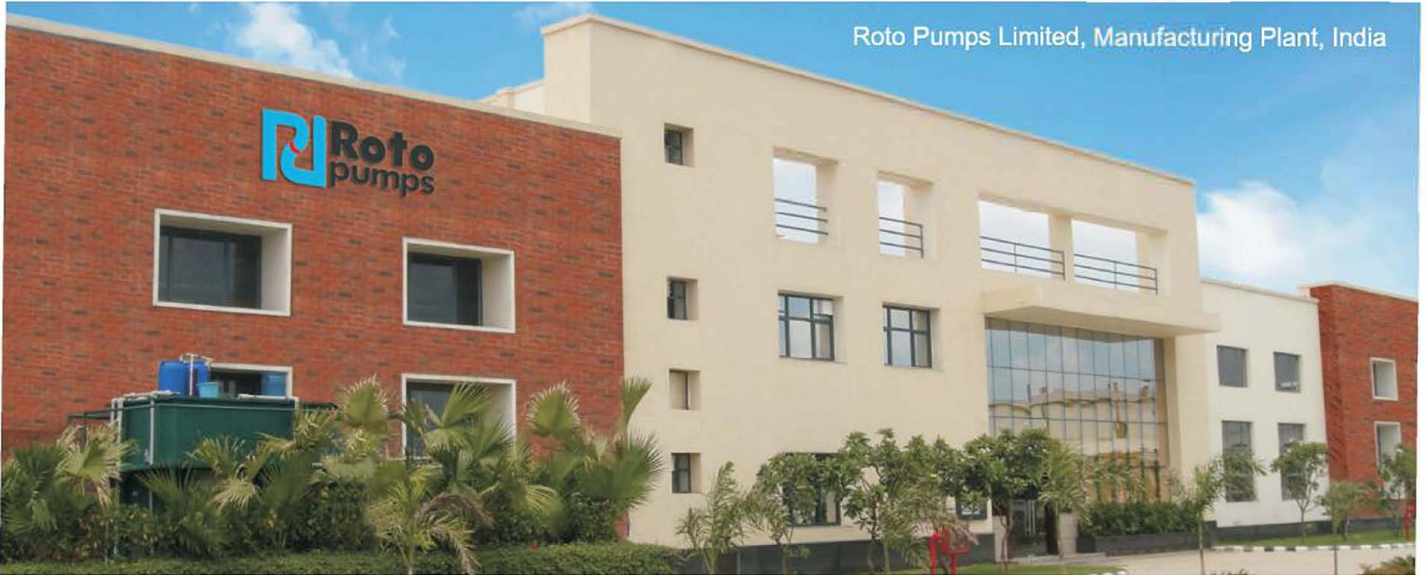
Roto Pumps Limited, Manufacturing Plant, India