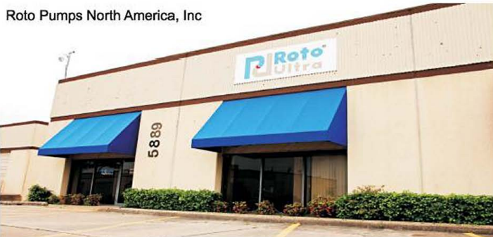
Roto Pumps North America, Inc