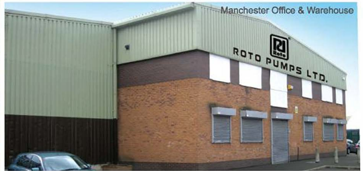
Manchester Office & Warehouse