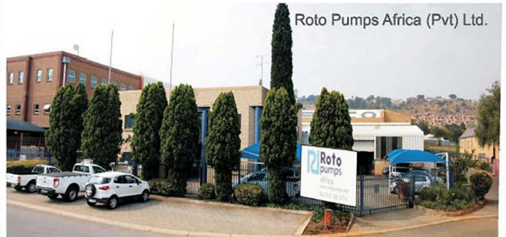
Roto Pumps Africa (Pvt) Ltd.