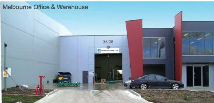
Melbourne Office & Warehouse